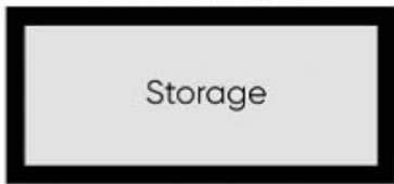
Storage (Not In Position)