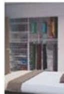
WARDROBE STORAGE SYSTEM