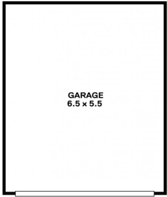
( NOT IN POSITION )